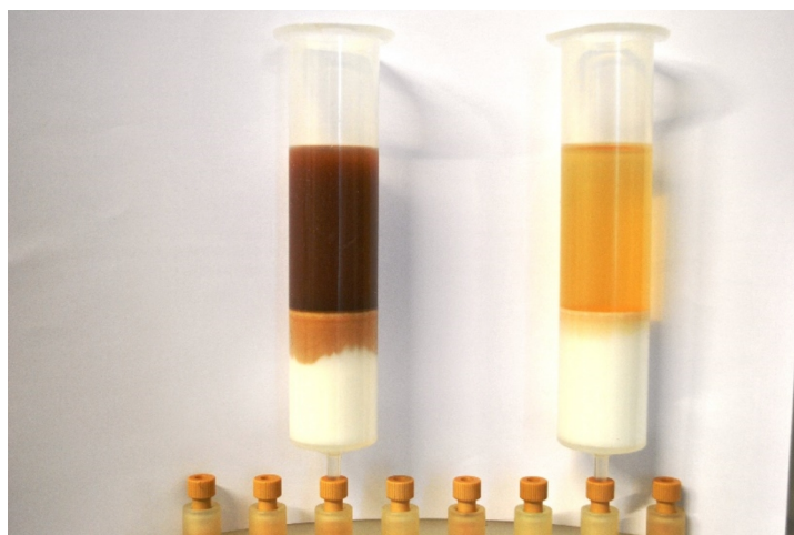
Figure 1 □ Example SPE extraction

In order to guarantee the absence of polyphenols in the eluate after passing through the column, add 3 drops of an aqueous solution of \text{FeCl}_3 to 3 mL detannised solids (DS) in solution. If the solution develops a blue-black hue, this means that the polyphenols have passed through the polymer; the analysis should then be repeated by reducing the quantity of initial product. If the solution remains colourless after this treatment, proceed with gravimetric analysis.